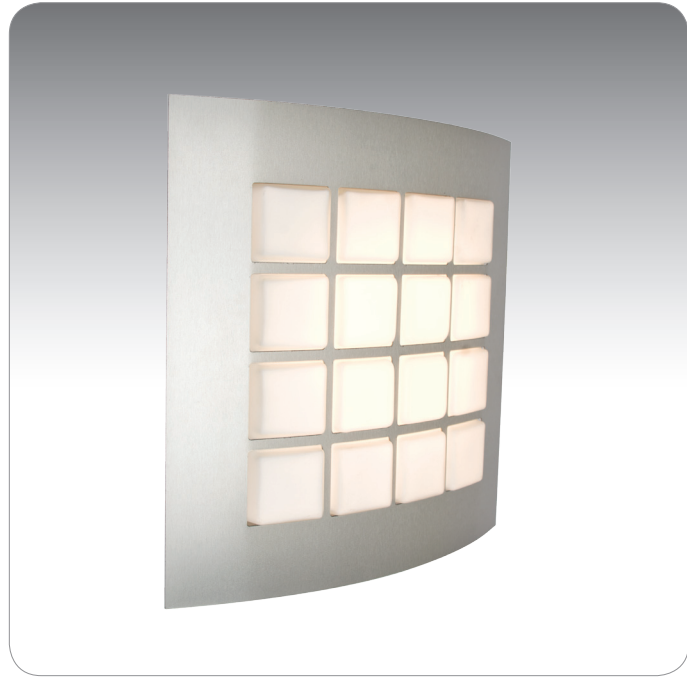
OPAL/ BLACK (QUAD10) & OPAL/SILVER (QUAD13)